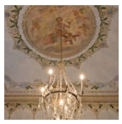
The Empress' Boudoir

This room was the private passageway that went from the rooms of Empress Elisabeth, "Sissi", and those of Emperor Franz Joseph. The balcony offers a breath-taking view of the Royal Gardens, looking towards the Basin of St. Mark's and the nearby island of San Giorgio. The vault in this room is from the Napoleonic period (1810-1811). With a regular geometrical pattern in large fake coffers with tondos and octagons, the remarkably neoclassical decoration is a work of Giuseppe Borsato. In the octagons, against a delicate green background are small figurative mythological groups inspired by the Roman paintings of Ercolano. Added in 1854, the red hanging is preserved under a reproduction. The neoclassical chandelier is in gilded bronze.