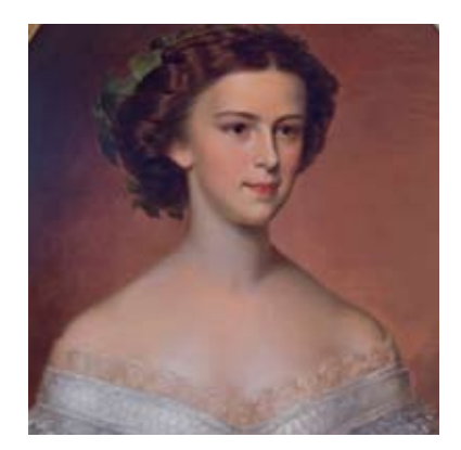
Portrait of the Empress Sissi

The neoclassical room was designed and decorated for the Napoleonic court by Giuseppe Borsato in 1810-1811. In 1854-1856 slight changes were made, also to the colours, perhaps by Giovanni Rossi. The 'umbrella' vault created by the combination of eight semicircular veils is airy; the decorations are inspired by Pompeii, with slender stylised racemes, plaques and medallions with birds and divinities (Neptune, Apollo, Juno, and Apis). With fake half columns in stucco, the walls are decorated with geometrical panels with golden ornamentation in slight relief, in chiaroscuro, and with multicoloured flowers. The remarkable marble busts are the portraits of Napoleon Bonaparte and of his second wife, Marie-Louise of Austria. They are works by the scultptor Luigi Pizzi (1810 ca.).