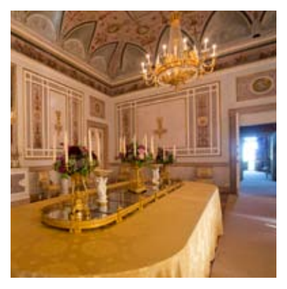
Dining-room for week-day lunches

The red and gold wall hanging (Rubelli, Venice) is a faithful reproduction of the one that was placed here in 1854 (probably French) and preserved under today's. The elegant imperial furniture is all original. The large glass chandelier with multicoloured flowers was made on Murano in the eighteenth century.