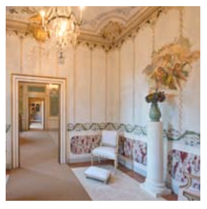
The Empress' Boudoir