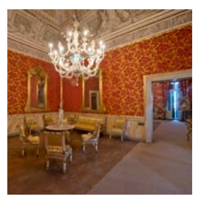
Lombardy-Venetian Throne Room