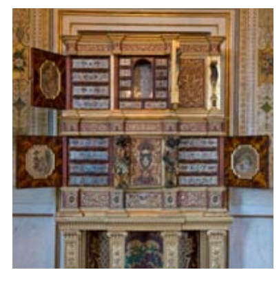
The Empress' Study

This small "dressing room" was for young Elisabeth and part of the work carried out in 1854 with new decorations by Giovanni Rossi. The walls and ceiling are all in an extraordinary grey-blue marmorino with shining micro-crystals. There are light garlands and 'capricious' motifs around it created by the interweaving of slender white stuccoes, coloured or gold