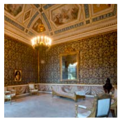
The Empress' Bed chamber