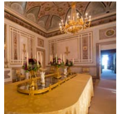
Dining-room for week-day lunches

Next to the large room of honour, this room had two functions: a dining-room for non-official occasions such as daily 'work' meetings of the Government cabinet, and as an antechamber to the following Lombardy-Venetia Throne Room. It was rebuilt as a Reception Hall in 1836. Designed and carried out by Giuseppe Borsato in the same year, its decorations are among the most successful in the palace and are testimony to the continuation of the neoclassical style long after the Napoleonic age. On the walls exquisite multicoloured candelabra-shaped frescoes are framed by marmorino (a particular kind of Venetian plaster) inlays in delicate grey-viola and green-gold hues, with winged relief figures in gilded stucco in between. The vaulted ceiling with its 'grotesque' decorations rests on a frieze along the walls depicting the figures of marine divinities. Of interest is not only the original neoclassical furniture, but also the lavish French table centre piece in gilded bronze (not originally from the palace).