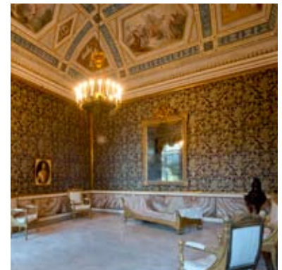
The Empress' Bed chamber

The painting between the windows is an altar piece by Carlo Caliarì, the son of the celebrated sixteenth century painter Paolo Veronese. It was originally made for a church in northern Veneto (Belluno) and requisitioned during the Napoleonic period. Then it was placed in the altar of the Chapel of the Royal Palace.