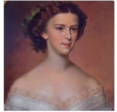
Portrait of the Empress Sissi

The neoclassical room was designed and decorated for the Napoleonic court by Giuseppe Borsato in 1810-1811. In 1854-1856 slight changes were made, also to the colours, perhaps by Giovanni Rossi. The 'umbrella' vault created by the combination of eight semicircular veils is airy; the decorations are inspired by Pompeii, with slender stylised racemes, plaques and medallions with birds and divinities (Neptune, Apollo, Juno, and Apis). With fake half columns in stucco, the walls are decorated with geometrical panels with golden ornamentation in slight relief, in chiaroscuro, and with multicoloured flowers. The remarkable marble busts are the portraits of Napoleon Bonaparte and of his second wife, Marie-Louise of Austria. They are works by the sculptor Luigi Pizzi (1810 ca.).