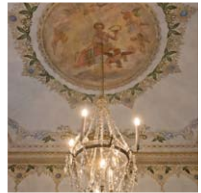
The Empress' Boudoir

decorations in slight relief and, above all, various small multicoloured flowers. Amongst them are lilies of the valley and corn flowers – a clear homage to Sissi's favourite flowers. There are also gilded metal lilies of the valley interwoven with the stuccoes in the corners of the ceiling and between the inlays of the buonagrazia canopy. At the height of the door on the cornice stucco eagles are supporting the coats of arms of the kingdoms of Austria and Bavaria. Unfortunately the figurative parts in oil are now in poor condition: in the medallion in the centre of the ceiling is The Protective Goddess of the Arts (her features are similar to those of the Empress) whilst on the wall is The Toilet of Venus . The 'bell-shaped' chandelier with Bohemian cut crystal is from the early nineteenth century.