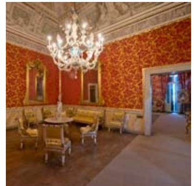
Lombardy-Venetian Throne Room