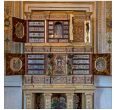
The Empress' Study

This small "dressing room" was for young Elisabeth and part of the work carried out in 1854 with new decorations by Giovanni Rossi. The walls and ceiling are all in an extraordinary grey-blue marmorino with shining micro-crystals. There are light garlands and 'capricious' motifs around it created by the interweaving of slender white stuccoes, coloured or gold